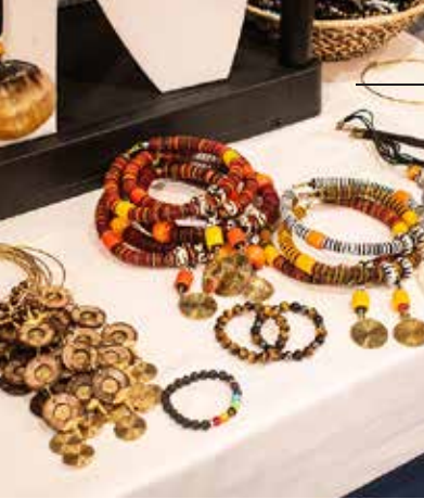
Exhibit Location: Wendell P. Holmes, Jr., Business Building 155 International Speedway Boulevard, Daytona Beach, FL 32114

Exhibit Dates: Wednesday, July 30th - Saturday, August 2nd